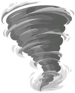
Rotating funnel-shaped cloud.

Tornadoes can destroy buildings, create deadly flying debris, flip cars, and pose a life safety risk.