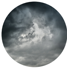
Dark or green-colored sky.